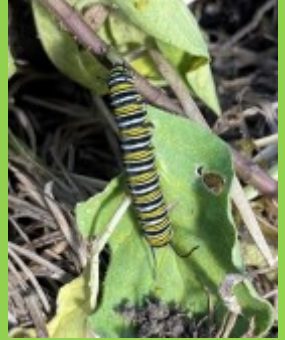
Photo: Monarch caterpillar on native Zizotes Milkweed in Aransas County.

Participants will also be asked to collect Zizotes seeds from their Waystations, in order to build up the seed bank for these hard-to-find natives. While creating a Waystation in your yard is not eligible for TMN reportable hours, you can get credit if you grow milkweeds for the MCTMN plant sale (PO: MCTMN Plant Sale); also if you conduct monitoring of Monarch larva and adults (FR: Insect Life).