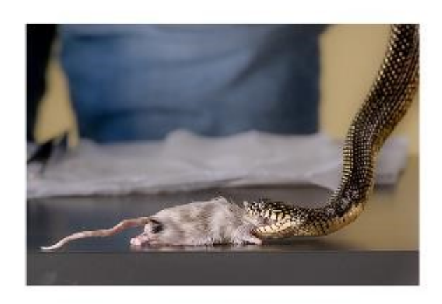
11:16:30 AM Speckled Kingsnake (Lampropeltis holbrooki)